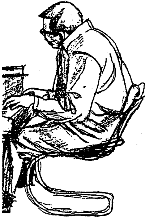
SELF-PORTRAIT AND TYPE DESIGN BY VINCE GUARALDI. COURTESY CARMELA GUARALDI